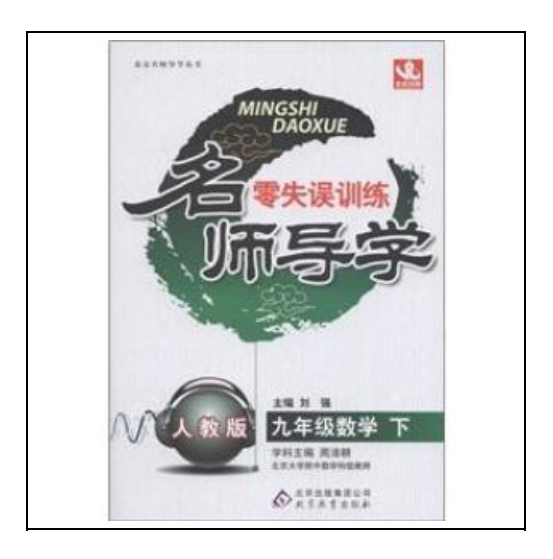
Filesize: 8.33 MB